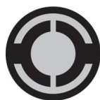
14mm 6MHz HT™ Crystals

HT™ and SQ™ crystals can be used in place of standard AT-cut quartz in all commercially available film thickness monitors and controllers, and they are the only materials that will work in Colnatec's self-cleaning and sealed sensor heads. They are available in 5 or 6 MHz versions, with gold, aluminum, or platinum (SQ™ only) electrodes, sized in 14mm (HT™ & SQ™) and 12.5mm (HT™ only) diameters.